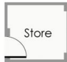
(Not Actual Location)