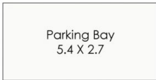
(Not Actual Location)