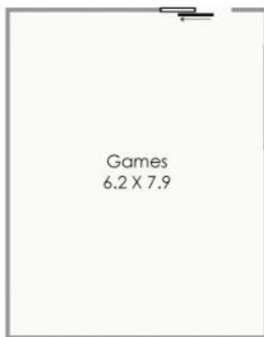
(Not Actual Location)